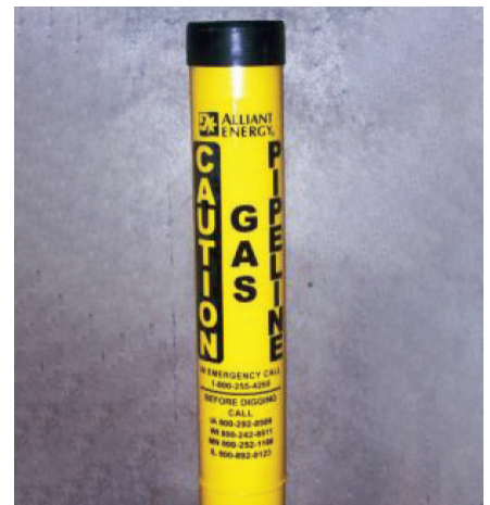
Alliant Energy Pipeline Markers – Found at road crossings, fence lines and street intersections. Markers do not indicate center of pipeline.